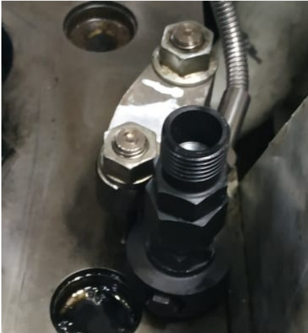
HTT-06 sensor mounted on a special designed indicator valve at a Wärtsilä 9L32 diesel engine

The HTT-06 cylinder pressure sensors are installed on special designed indicator valves for reducing operating temperature of 250—300 °C on measuring element. This allows perfect conditions for online monitoring of combustion pressure.