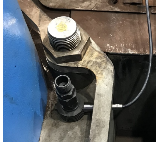
HTT-06 sensor mounted on a special designed indicator valve at a MAN 48/60 diesel engine.